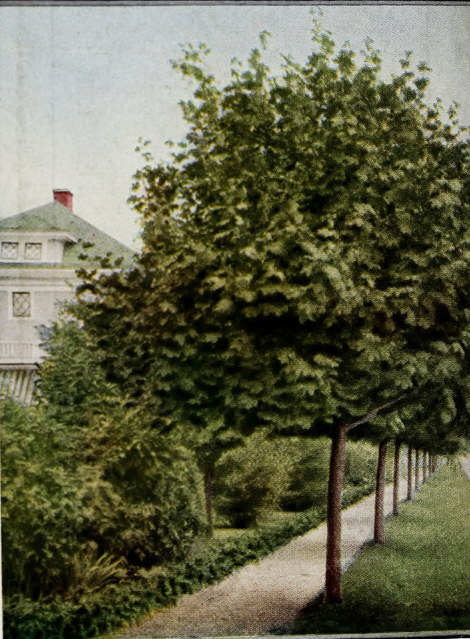
Norway Maples. The best tree for street planting